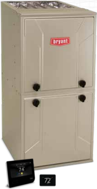
Control and Smart Sensor sold separately