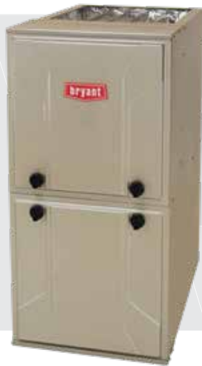
Model 987M and 986T